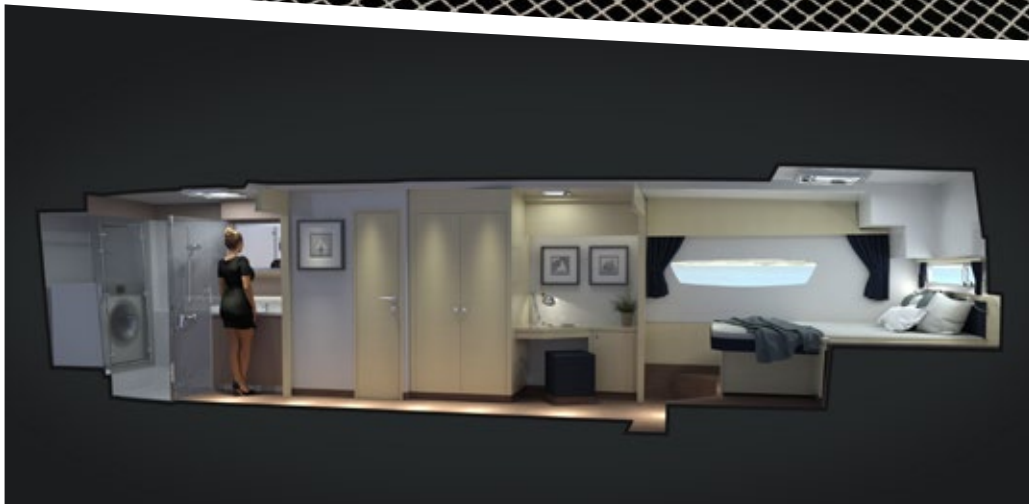
These are original photos of sailing catamaran Clione