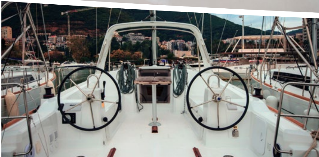
These are original photos of sailing yacht Lambada