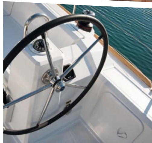
These are original photos of sailing yacht Salsa