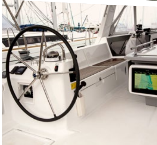
These are original photos of the sailing yacht Disco