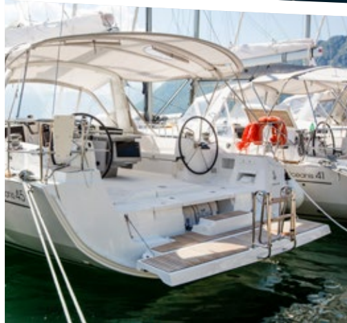
These are original photos of sailing yacht Rumba