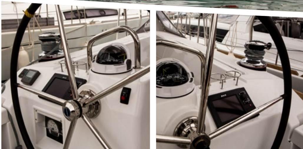
These are original photos of sailing yacht Samba