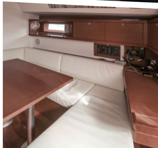
These are original photos of sailing yacht Twist