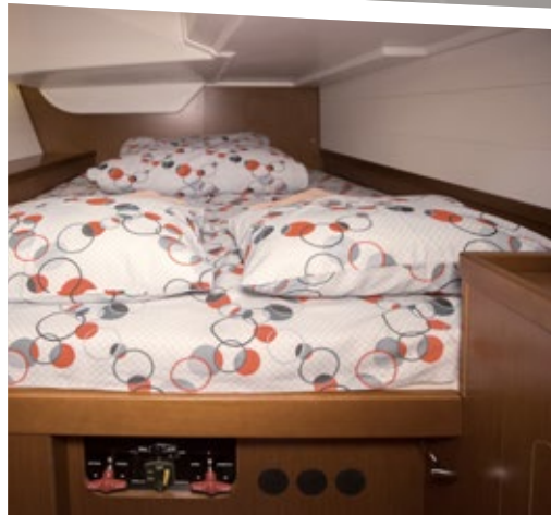
These are original photos of sailing yacht Blues