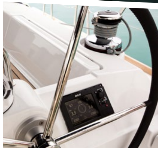
These are original photos of sailing yacht Jazz