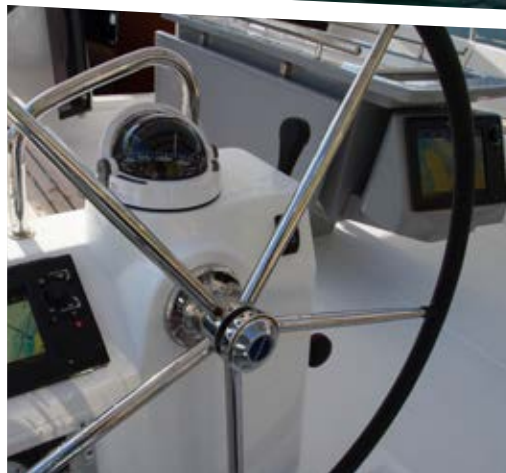
These are original photos of sailing yacht Tango