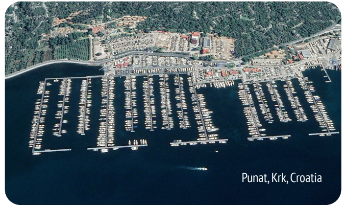
Punat, Krk, Croatia